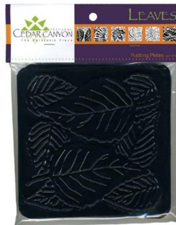
Rubbing plates-Cedar Canyon Textile plates, http://cedarcanyontextiles.com/

Stencils, cookie cutters, cake decorating, rubber stamps and even Your own home made ones are great to introduce all the way through The collage process.