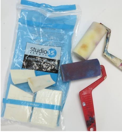
I use these cosmetic wedges sponges and the house sponge trim rollers for stenciling and stamping. Great tools have around.