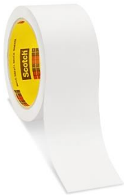
White tape 3M #3051- http://www.uline.com/Index.aspx

And I like to use a workable fixatif to coat the drawing mediums before any more collaging continues.