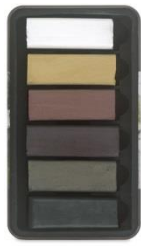
Lyra graphite Crayon