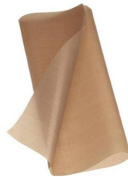
Safety release sheets